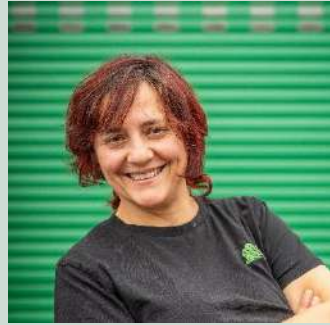
ANA SANDWICH MAKER