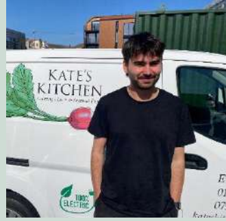
TYLER DELIVERY DRIVER