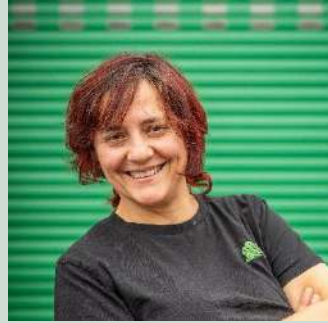
ANA SANDWICH MAKER